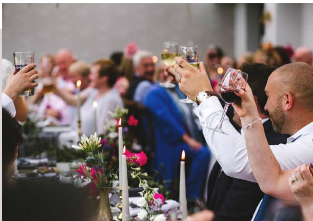
Honey & The Moon Photography